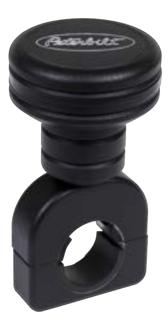
Steering Wheel Spinner